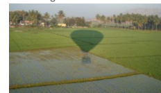
Go With The Flow in Marvelous Hot Air Balloon