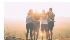
Top 20 Fun Things to Do with Friends