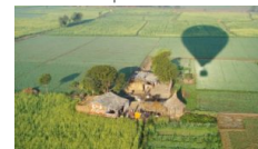
All You Need To Know About The Hot Air Balloon Experience