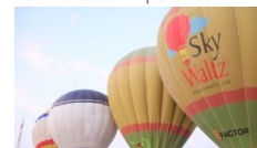
Best Things to Do While Travelling with Friends