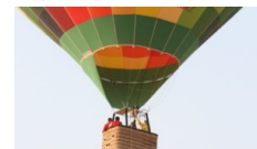
Activities You Shouldn't Skip In Your Next Jaipur Vacation